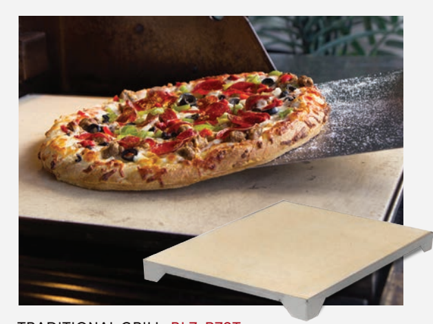
TRADITIONAL GRILL: BLZ-PZST PROFESSIONAL GRILL: BLZ-PRO-PZST-2