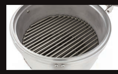
1-inch Thick Cast Aluminum This design adds unparalleled durability.