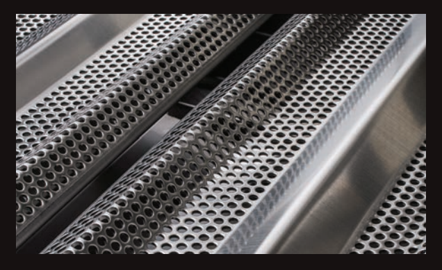
Perforated Flame Stabilizing Grids Designed to minimize flare-ups, the perforated flame stabilizing grids also serve as excellent protection for the burners below.