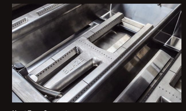
Heat Zone Separators Removeable heat zone separators divide cooking surface into individual temperature zones putting you in command of every inch of cooking.