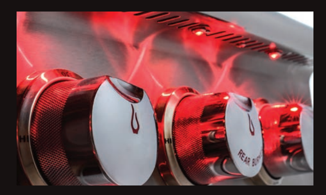
Illuminated Control Knobs Sophisticated red LED lights illuminate and accent the control knobs.