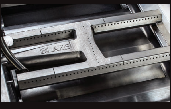
Cast Stainless Steel Burners Professional-quality, cast stainless steel H-burners deliver impressive cooking power and durability.