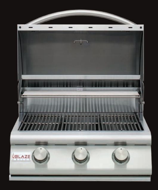
BLZ-3LBM-NG/LP OPTIONAL CART: BLZ-3-CART

This Blaze series provides affordable, commercial-style gas grills that any backyard cook can enjoy. Property managers should make note of the Prelude LBM's approval and warranties for multi-user settings like apartment complexes, condos, hotels, and resorts. No matter the installation site, these grills are built to last and to make grill masters out of everyone.