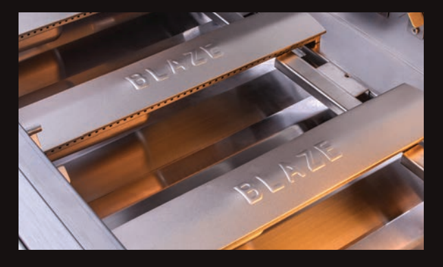
Cast Stainless Steel Burners Professional-quality, cast stainless steel Linear burners deliver impressive cooking power.