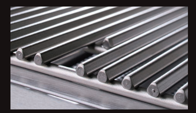
Heavy-Duty 9mm Triangular Cooking Rods Patented* 9mm triangular cooking rods maximize your searing capabilities.