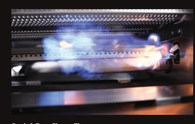
Push & Turn Flame Thrower Primary ignition system delivers a fast start every time.