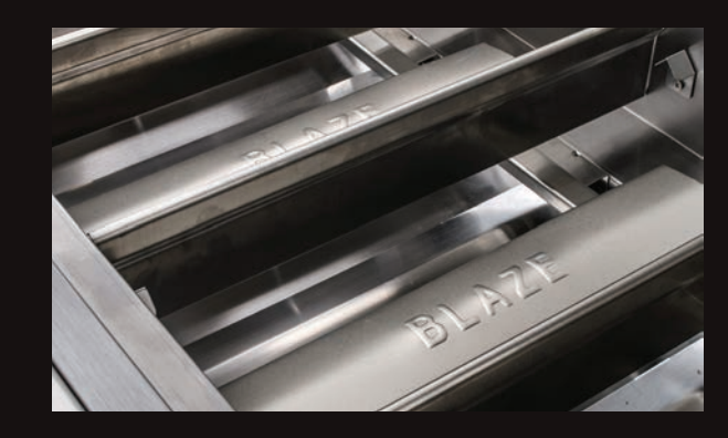
Heat Zone Separators Removeable heat zone separators divide cooking surface into individual temperature zones putting you in command of every inch of cooking.