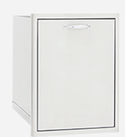
Double Trash/Recycle Drawer BLZ-TREC-DRW