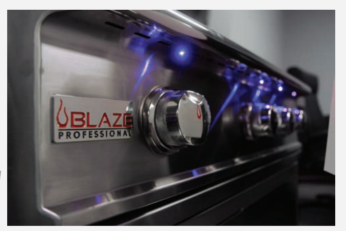
BLZ-4B-LED-AMBER, BLUE, WHITE BLZ-5LTELED-AMBER, BLUE, WHITE BLZ-2LED-AMBER, BLUE, WHITE BLZ-3PROLED-AMBER, BLUE, WHITE