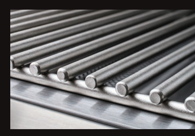
Heavy-Duty 8mm Round Cooking Rods Durable 8mm stainless steel cooking rods maximize your searing capabilities.