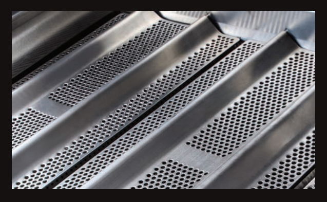
Perforated Flame Stabilizing Grids Heavy-duty 12mm flame stabilizing grids cover the entire grill to maximize flavor and minimize flare-ups.