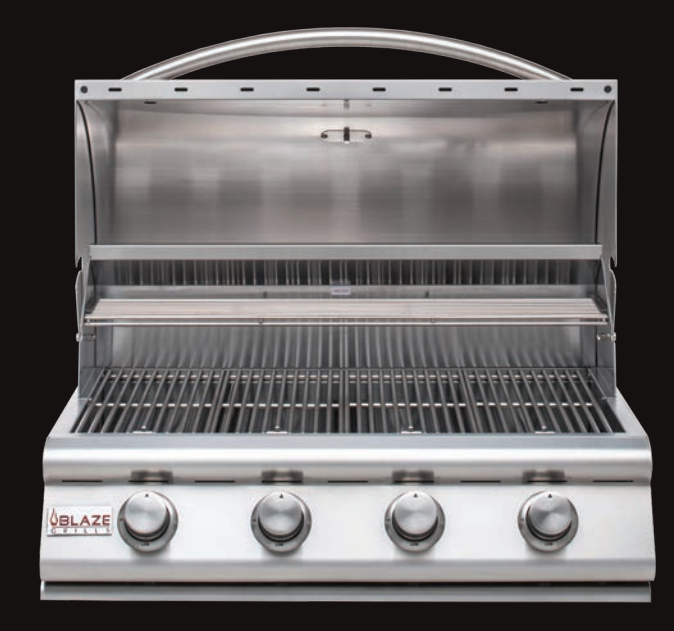
BLZ-4LBM-NG/LP OPTIONAL CART: BLZ-4-CART