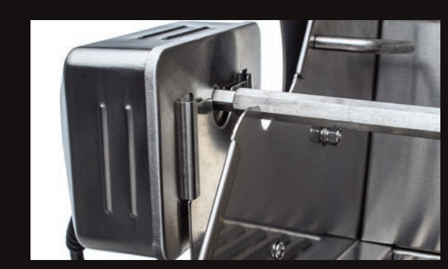
Rotisserie Kit Included rotisserie kit with waterproof motor provides grilling versatility.