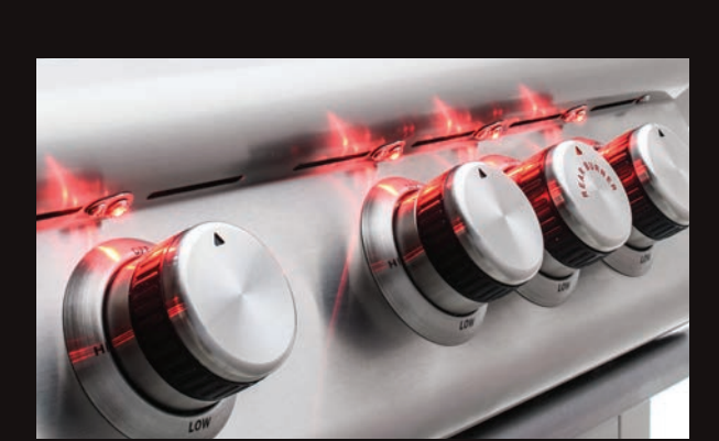
Illuminated Control Knobs Sophisticated red LED lights illuminate and accent the control knobs.