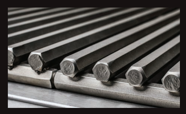
Heavy-Duty Hexagonal Cooking Rods 12mm thick cooking rods absorb heat, producing deep sear marks.