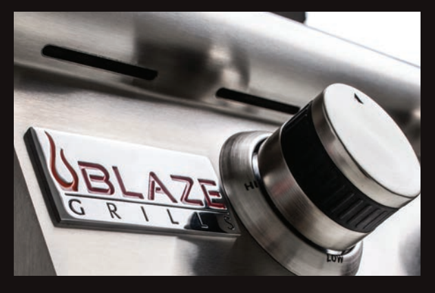
Push & Turn Flame Thrower Primary Ignition system delivers a fast start every time.