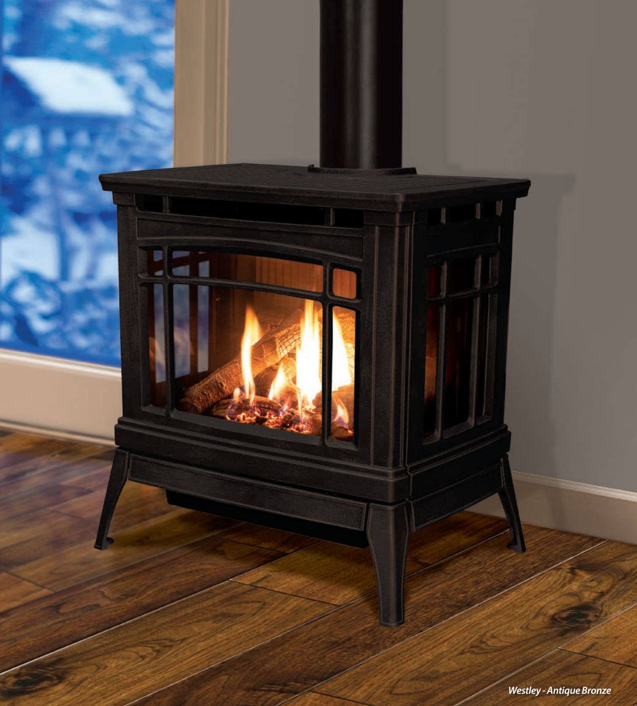
Westley - Antique Bronze