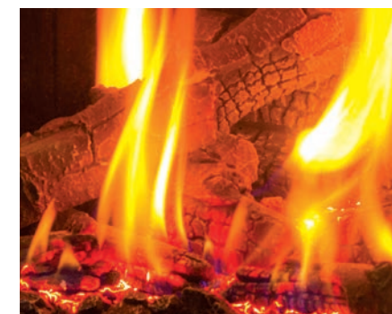
9 Piece ultra high definition log set