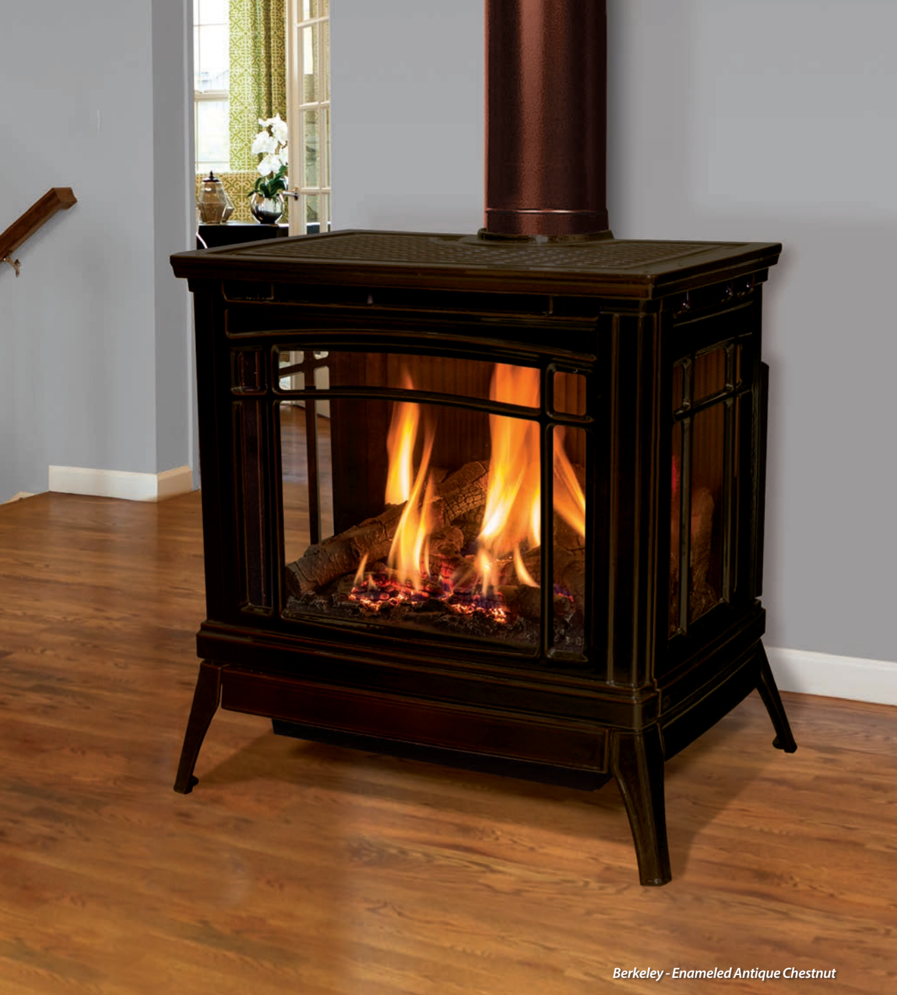
Berkeley - Enameled Antique Chestnut